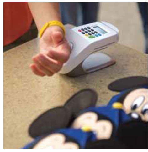
As to Disney artwork and properties

*MagicBands are available to guests staying at selected Walt Disney World Resort Hotels. MagicBands are intended for use in the US. Privacy is important to us—visit mydisneyexperience.co.uk/privacy for information about our privacy and data collection policies.